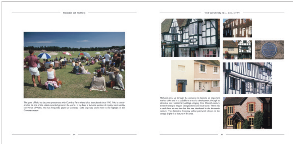
Example of a double page spread.