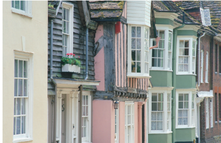
The Causeway, Horsham.