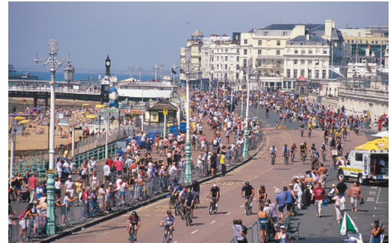
The annual London to Brighton cycle ride.